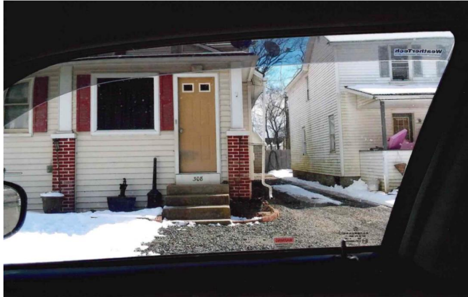
Photos taken from automobiles with the automobile still visible.