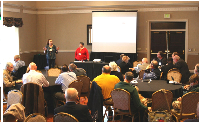
The Maryland Whole Community Summit included members from the emergency management, voluntary, and private sectors.