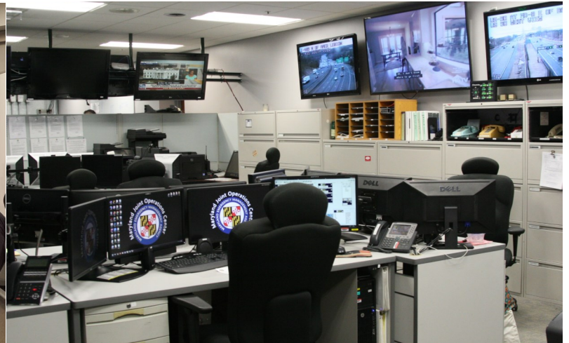
The Maryland Joint Operations Center, the State's 24/7 watch center.