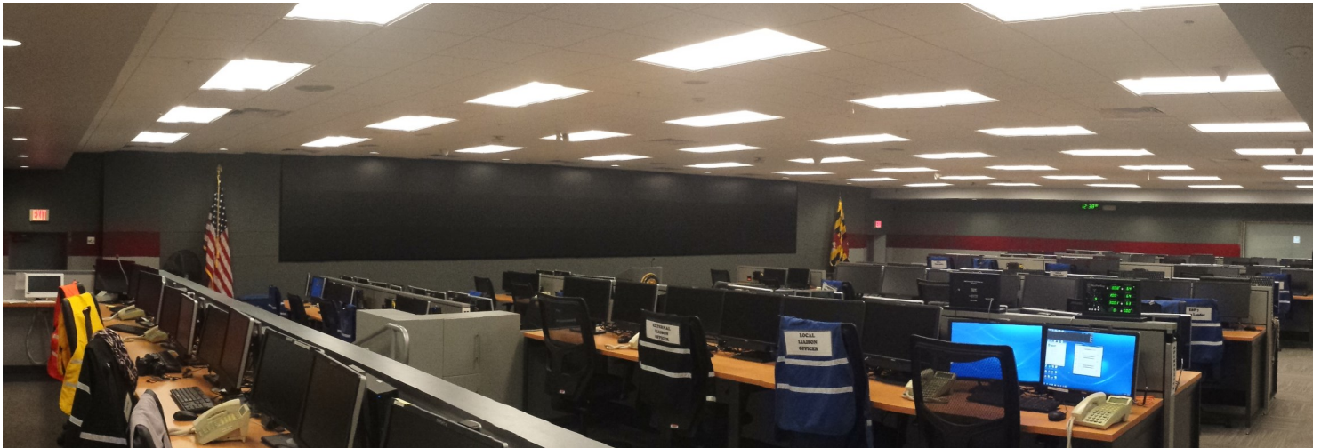
The State Emergency Operations Center