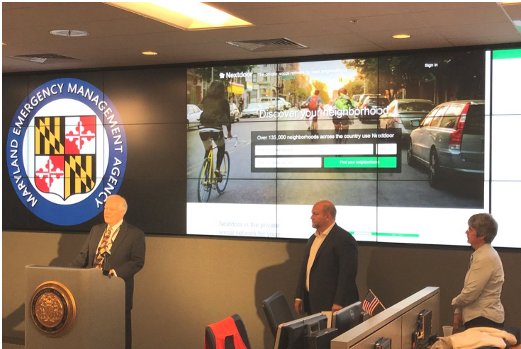
Press conference announcing the Maryland Emergency Management Agency's partnership with Nextdoor, the private social network for neighborhoods.